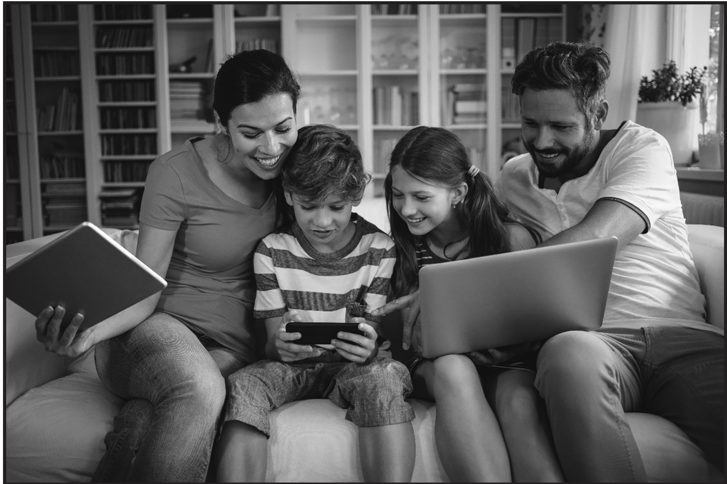
Photograph – A family using digital devices in their everyday lives.